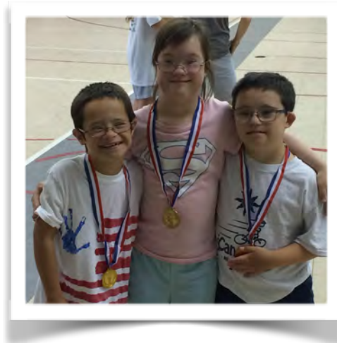
iCanShine Bike Camp 2016