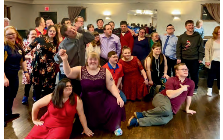
We had tons of fun at the Fall Dance in November!