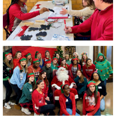
Breakfast with Santa was a big hit!