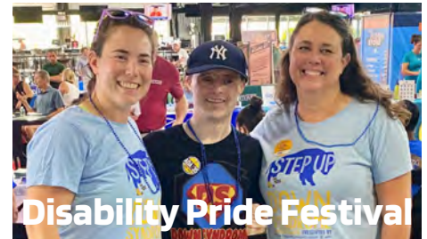
Disability Pride Festival

Does your loved one with Down syndrome have trouble wearing a CPAP mask for the treatment of severe obstructive sleep apnea? (OSA) We are doing a research study to see if placing a surgically implanted nerve stimulator to treat OSA significantly improves the neurocognition and expressive language skills in people with Down syndrome, ages 10-21. This device has already been tested and FDA-approved for use in adults with moderate to severe OSA who are unable to use CPAP. If you are interested in learning more about this research study, please contact the research team by calling Dr. Hartnick at (617) 573-4206 or by e-mail at Christopher_Hartnick@meel.harvard.edu .